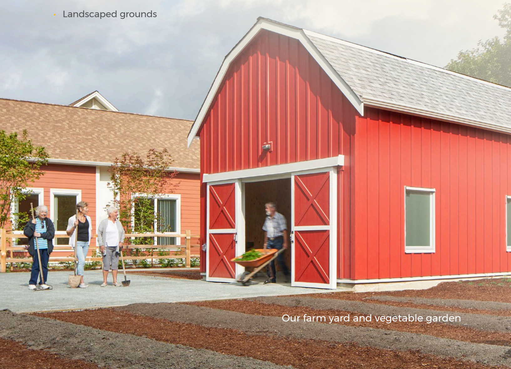
Our farm yard and vegetable garden