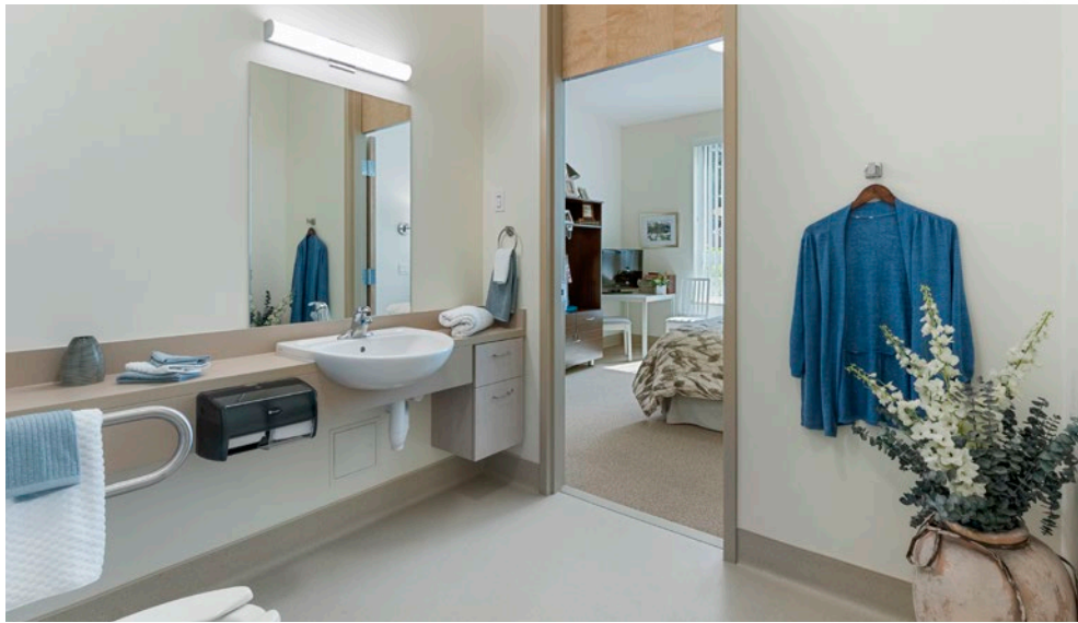
In suite bathroom